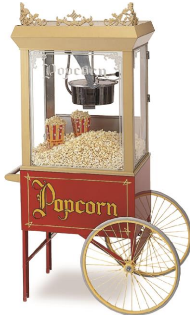
Cart shown with Model 2014 Popper for reference only (items sold separately)